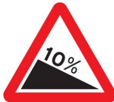
English road sign 'steep hill downwards'

Example 1: a 10 % gradient (1:10 or 1/10 or 0.1) means that the elevation change is 10 meters over 100 meters traveled.